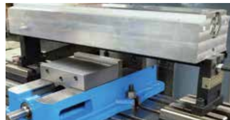
Using Extension Kit