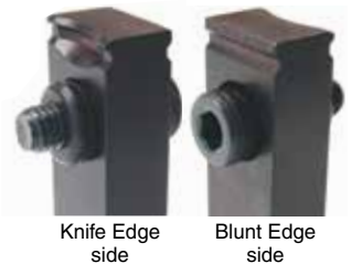
Knife Edge side

NOTE: Blunt Edge side is recommended for alloys above 35Rc